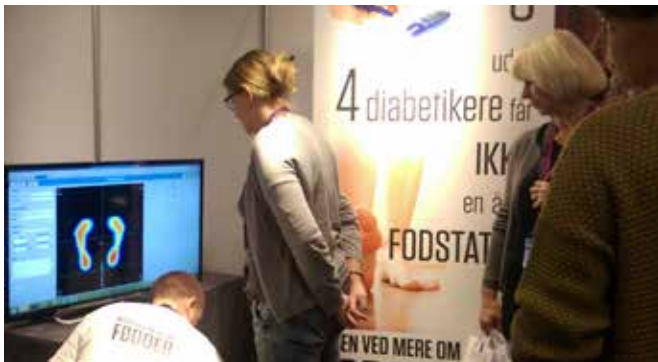
The Danish Association present at the annual conference for general practitioners and nurses in the medical practice.