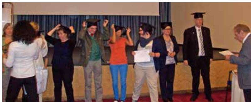
Still unfamiliar and new - the first 12 Bachelor of Science Podology in Germany during the Bachelor Degree dedication

We are very happy to have this way of education. At first instance the intense time at one of the 46 schools and for colleagues who want more, there is the possibility of a Bachelor of Science study. With this we closed up to most of the other European countries education.