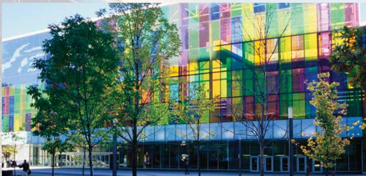
Montréal Convention Centre (Palais des congrès de Montréal)

Vous pouvez réserver vos chambres d'hôtel en même temps que vous vous inscrivez pour le Congrès. Sur le site d'inscription, nous avons inclus la liste d'hôtels. Vous êtes bien sûr libre à choisir un hébergement non inclus dans la liste; les choix ne représentent que les hôtels qui ont négocié des tarifs spéciaux avec le comité organisateur du Congrès mondial de la FIP-IFP.